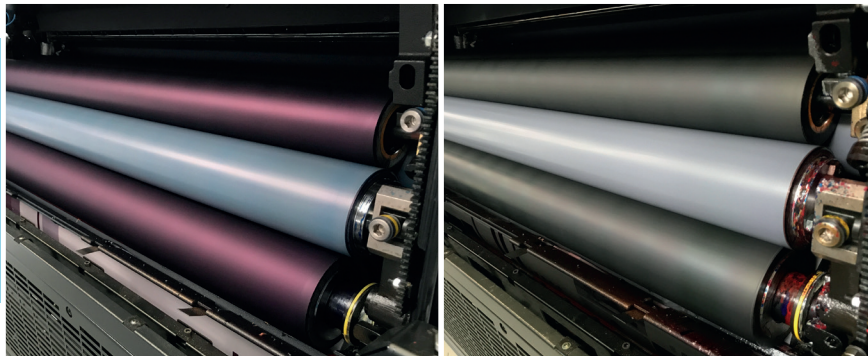
ECS compound after cleaning

As one of the world's leading manufacturers of cleaning and maintenance products for graphic applications, Böttcher supports its new roller compounds with washes developed to offer both chemical compatibility with the rubber roller coverings and excellent cleaning power, while fulfilling all H&S and press manufacturers' demands and specifications. Böttcher will also provide on-site support to any metal decorator looking to optimize their job changeover routines and increase productivity.